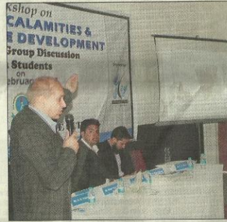
A speaker at a workshop on natural calamities and sustainable development held at The Indian Cambridge School in Dehradun on Monday.

Furthermore, by holding such workshops and through the innovative and cross-disciplinary teaching-learning process among the participants, it will inculcate an inherent sense of responsibility