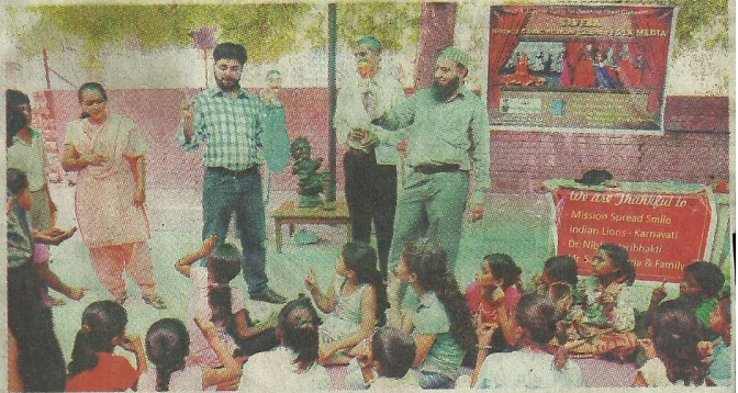
સ્વમ બાળકોને કઠપૂતળી જેવા પરંપરાગત માધ્યમ દ્વારા વિજ્ઞાનના સિદ્ધાંતો શિખવાડવા માટે એક કાર્યશાળાની શરૂઆત કરવામાં આવી છે.

ઈ ગ્લોબલ મિડીયમ સ્કૂલમાં અભ્યાસ કરતા કોઈ બાળકને જો વિજ્ઞાનના સૌન્દર્યનિયમો બોર્ડ ઉપર લખીને સમજાવી દેવામાં આવે, ત્યારબાદ તે બાળકની પરીક્ષા લેવામાં આવે તો તે બાળક સારા નંબર સાથે પાસ થઈ જાય. પણ જો આજ રીતે કોઈ સ્વમ બાળકને સમજાવીને તેની એક્ઝામ લેવામાં આવે તો કદાચ તે બાળક આ એક્ઝામમાં પાસ થઈ શકશે નહીં. કારણ કે એ બાળકને વિજ્ઞાન એટલે શું? તેનો કોઈ ખ્યાલ નથી? પરંતુ શહેરના સેટેલાઈટ વિસ્તારમાં આવેલી દેવાપિશ સ્કૂલમાં અત્યારે એવી કાર્યશાળા ચાલી રહી છે. જેમાં આ સ્વમ વિસ્તારમાં રહેતા બાળકો કે જે છુટક મજૂરી કરીને પોતાના માતા પિતાની મદદ કરે છે, તે બાળકોને પેપેટ શો ( કઠપૂતળી)ના માધ્યમથી વિજ્ઞાનના સિદ્ધાંતો શિખવાડવામાં આવી રહ્યા છે. આ તમામ બાળકોને શહેરના અલગ અલગ વિસ્તારમાંથી અત્યારે આ સ્કૂલમાં લાવીને આ વિજ્ઞાનના પાઠ શિખવાડવામાં આવી રહ્યા છે. આ બાળકોને પેપેટના માધ્યમથી વિજ્ઞાન શિખવવા માટે સ્પેશિયલી દિલ્હીના સાયન્સ ડિપાર્ટમેન્ટમાંથી બે વ્યક્તિને બોલાવવામાં આવ્યા છે. આ વર્કશોપમાં વિજ્ઞાનના નિયમો ઉપરાંત કઠપૂતળીને કાગળમાંથી કઈ રીતે તૈયાર કરવી, ઉપરાંત પેપેટ કઈ રીતે