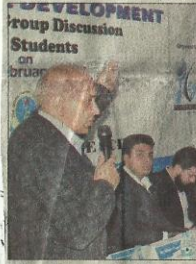
द इंडियन कैम्ब्रिज स्कूल में आयोजित कार्यशाला में विचार रखते वक्ता।

स्कूली बच्चों ने उत्साह से कार्यशाला में लिया हिस्सा